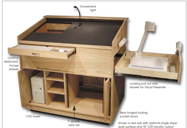
ESL-48 MULTIMEDIA LECTERN

Our ESL-48 Multimedia Lectern is the largest lectern in our Essential line. The 48" size allows plenty of room for equipment in both the lower section and the work surface. As with our ESL-32 and ESL-40 Multimedia lecterns, the ESL-48 ships within 30 days.