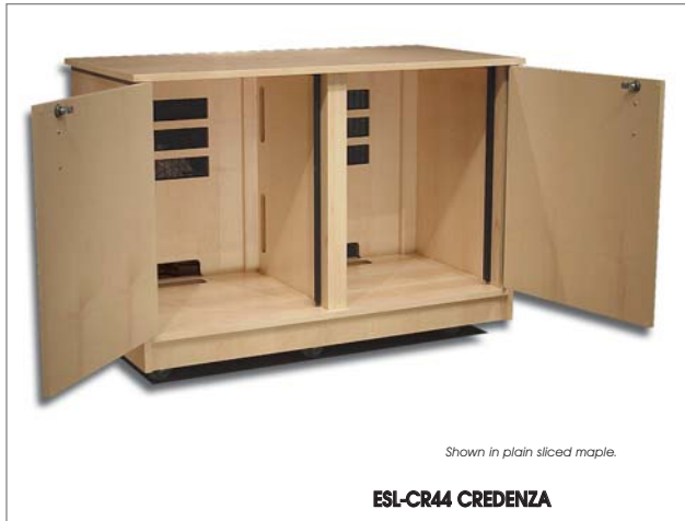
Shown in plain sliced maple.

KSI'S SOLUTIONS FOR TIME SENSITIVE PROJECTS