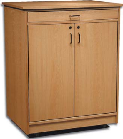
Shown in plain sliced red oak.