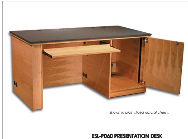
Shown in plain sliced natural cherry.

KSI'S SOLUTIONS FOR TIME SENSITIVE PROJECTS