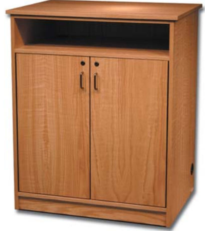
Shown in plain sliced red oak.