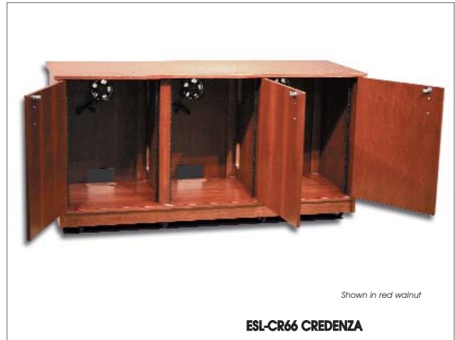
Shown in red walnut

DIMENSIONS 43.5" w x 22" d x 31.5" h STANDARD FEATURES 3.5" recessed swivel casters vented removable rear panels dual 14 space rack sections front locking doors STANDARD FINISH A-1 grade plain sliced red oak with clear KSI finish