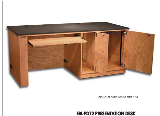
Shown in plain sliced red oak.

A-1 grade plain sliced red oak with clear KSI finish