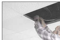
Wire the loudspeaker and connect to the structure above. See Note.