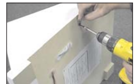
Screw on the supplied hooks.