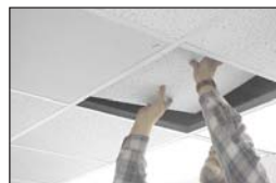
Replace the second tile.