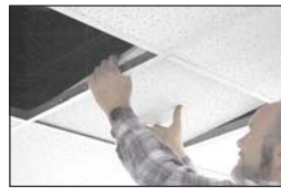
Remove two ceiling tiles.