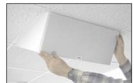
Snap on the grille and replace the second tile.

NOTE: You must make sure that electrical connections meet all local codes. Make absolutely sure that the loudspeaker is securely attached to the grid and structure above.