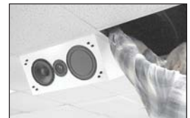
Wire the loudspeaker and connect to the structure above. See Note.