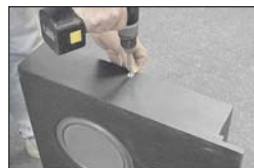
Screw on the supplied hooks.