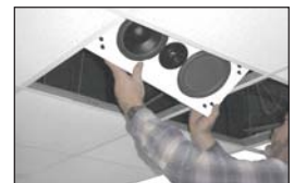
Slide the loudspeaker through the opening. Make sure that it fits flush.