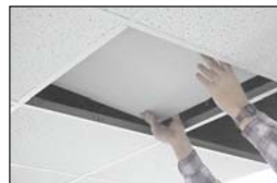
Place the grille into the first opening.