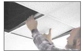
Remove two ceiling tiles.