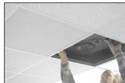
Slide the loudspeaker onto the grille.